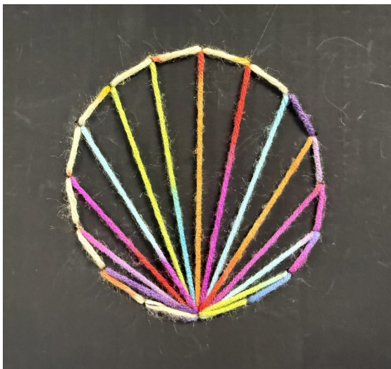
Grade 4C String Art