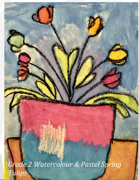
Grade 2 Watercolour & Pastel Spring Tulips