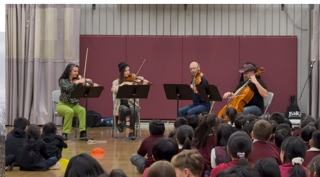
Black Dog Quartet performance