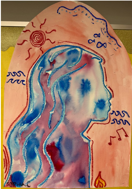
Grade 6M Multimediam Silhouettes