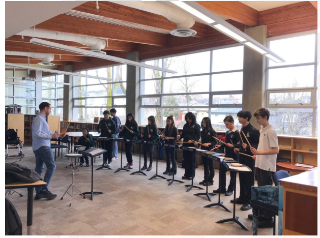
Grade 7 band students take part in workshops and a performance at Notre Dame Regional High School.