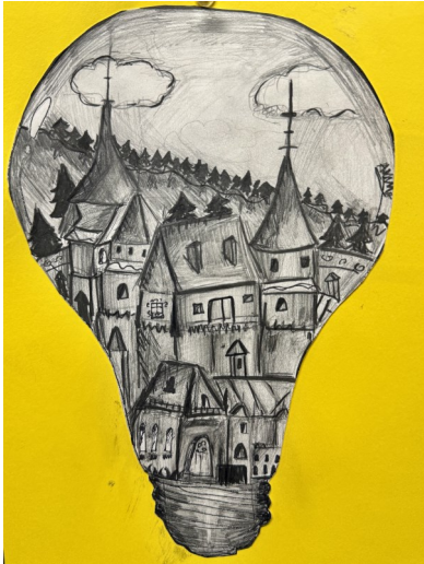
Grade 6L drawings inspired by Maya Angelou quote "Nothing can dim the light that shines from within."