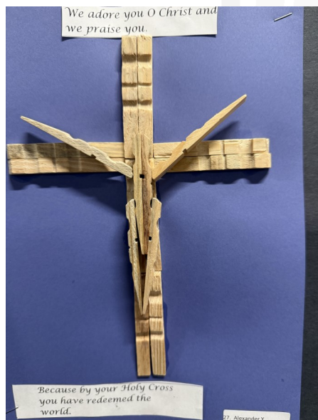
Grade 1 Clothes Pin crucifix