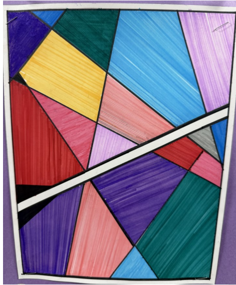
Grade 6M Geometric Art