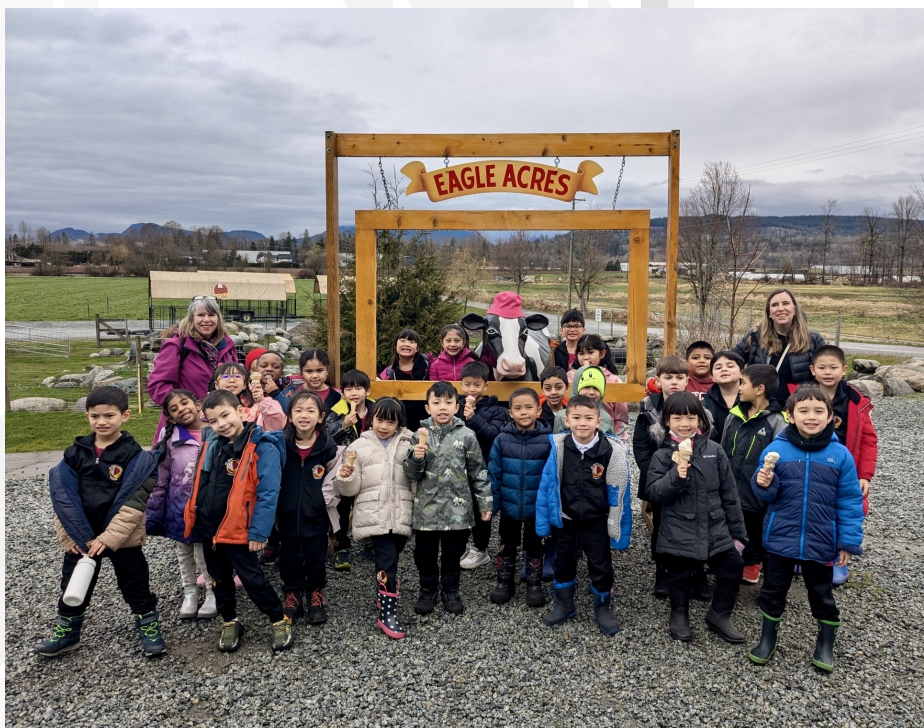
Grade 1 enjoying a visit on the farm at Eagle Acres