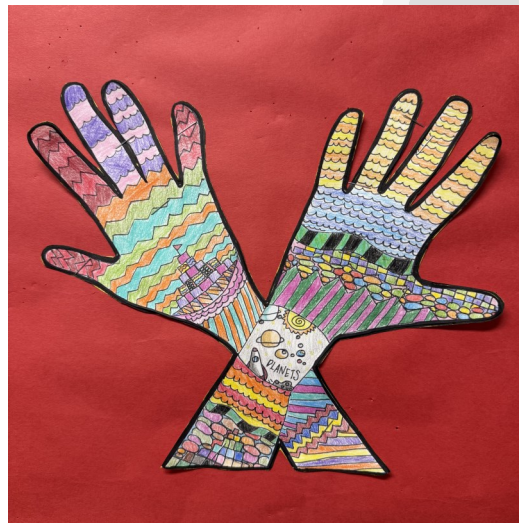
Grade 4Q Handfuls of Patterns