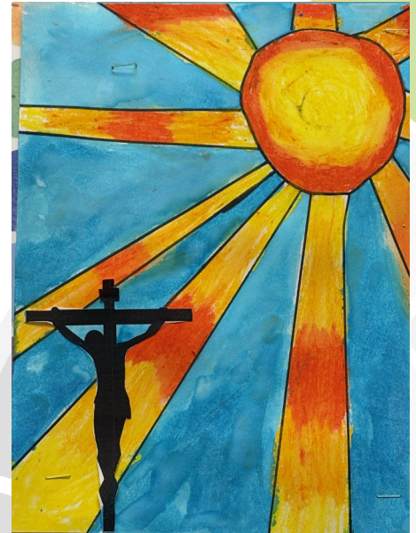
Grade 3 Sun Ray Crucifix