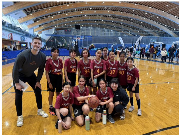
Grade 6 Girls Basketball Team at the Richmond Olympic Oval

We look forward to another fun and active term ahead!